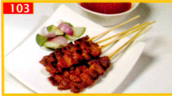
Singapore Chicken Satay 12 sticks