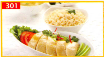
Hainanese Chicken Rice Rs. 588.00