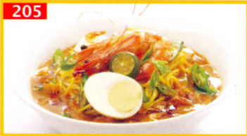
Mee Rebus Rs. 668.00