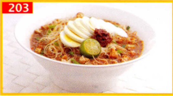
Mee Siam with Prawn Rs. 498.00