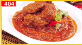
Beef Rendang Curry Rs. 638.00