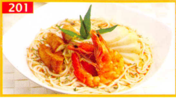
Laksa with Prawn Rs. 688.00