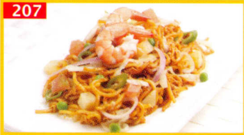
Mee Goreng with Seafood "Punggol Style" Rs. 598.00