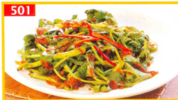
Stir - Fried Sambal Kangkong Rs. 338.00