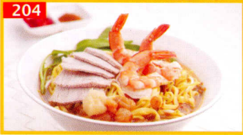
Prawn Noodles Soup Rs. 668.00