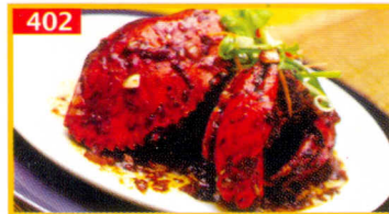
Black Pepper Crab Seasonal Price