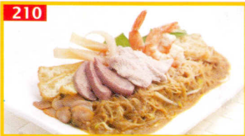
Satay Bee Hoon Rs. 668.00