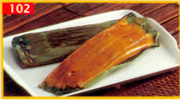
Otah Otah 1 pc