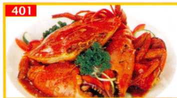
Singapore Chilli Crab Seasonal Price