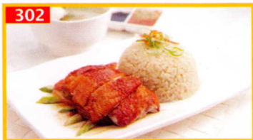
Crispy Chicken Rice Rs. 588.00