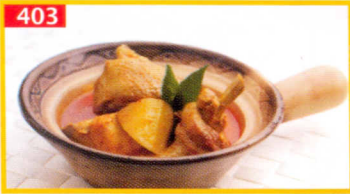
Singapore Chicken Curry Rs. 638.00