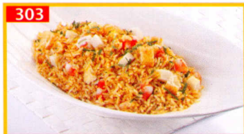
Laksa Fried Rice Rs. 598.00