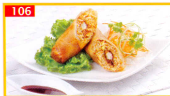
Crispy Spring Roll