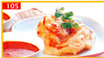
Roti Prata with Curry Gravy